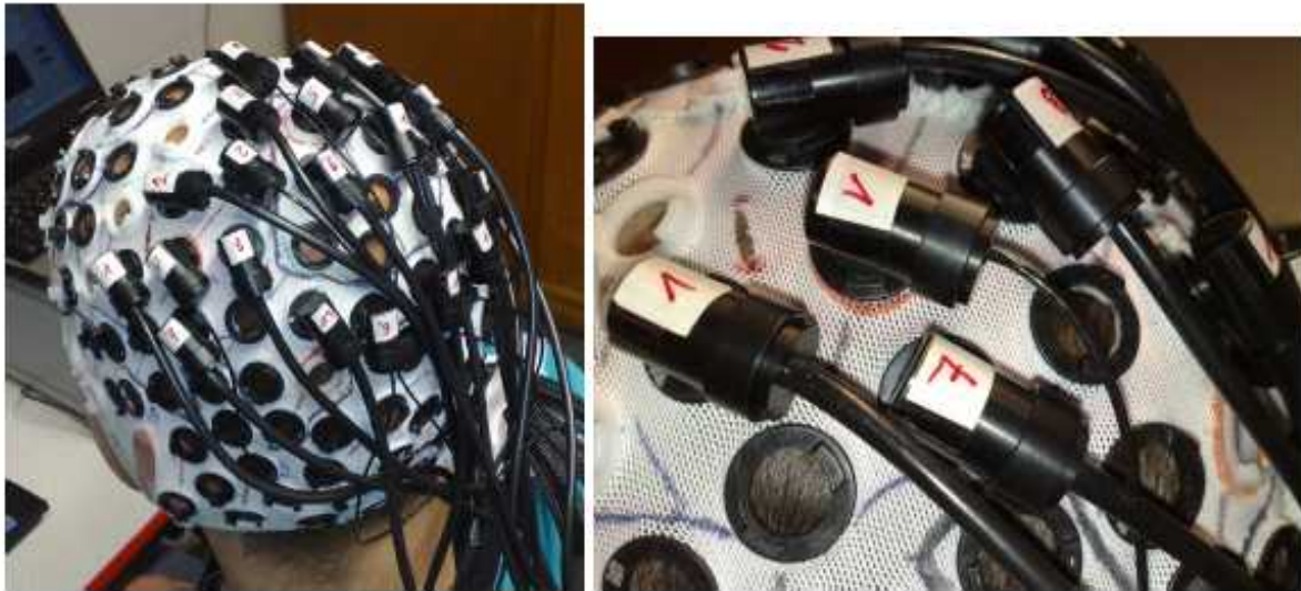
Figure 1: Optical probes as worn by the subject inside the fMRI head coil. A standard EEG cap is used to position the sensors on the head.

experiments, 510 volumes were acquired (15 coronal slices through the motor system, TR 1, flip angle 62^\circ ). Optical data was acquired with a NIRScout 816 (2 wavelengths, 8 sources, 16 detectors, sampling frequency 6.25 Hz) produced by NIRx Medizintechnik GmbH, Berlin, Germany. The optical probes were integrated in a standard EEG cap which allows full head coverage and positioned over bilateral motor cortices (figure 1).